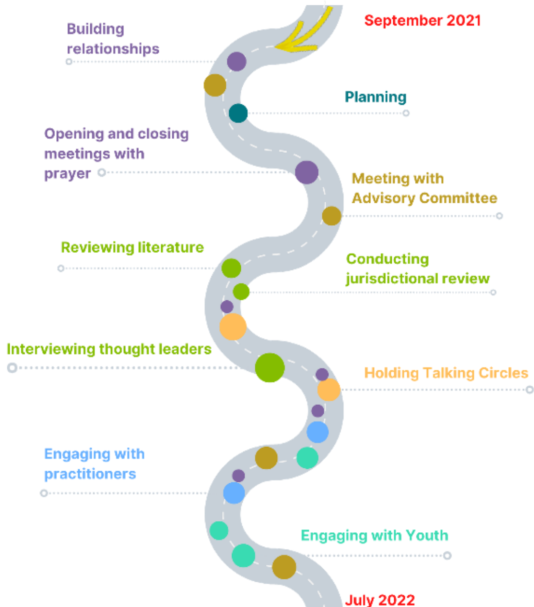
Figure 1. Project timeline and activities.

In this section we describe the activities that we undertook to facilitate our learning journey and achieve the project purpose. For a detailed description of methods, see Appendix A . Our goal was to describe child and youth well-being for use among diverse communities across the continuum of child welfare services and programs in Alberta. See Figure 1 for an overview of our activities and timelines.